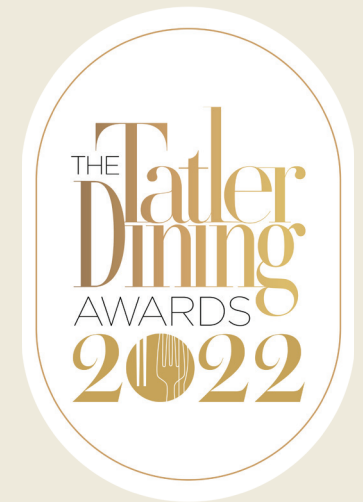
T.DINING BEST RESTAURANT 2021/2022