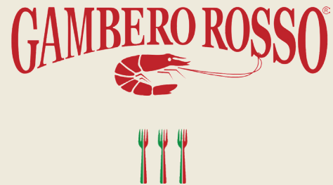
GAMBERO ROSSO 3 FORKS 2020 - 2022