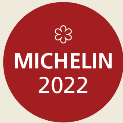
ONE MICHELIN STAR 2017 - 2022