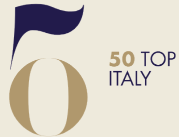
NO. 14 50 TOP ITALY 2022