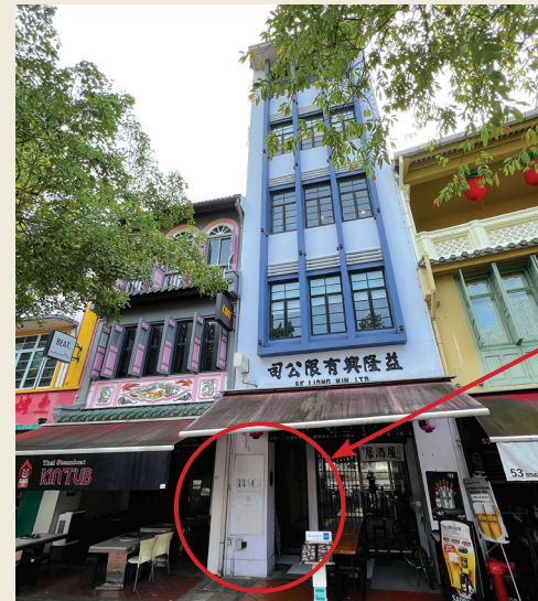
Entrance to Braci